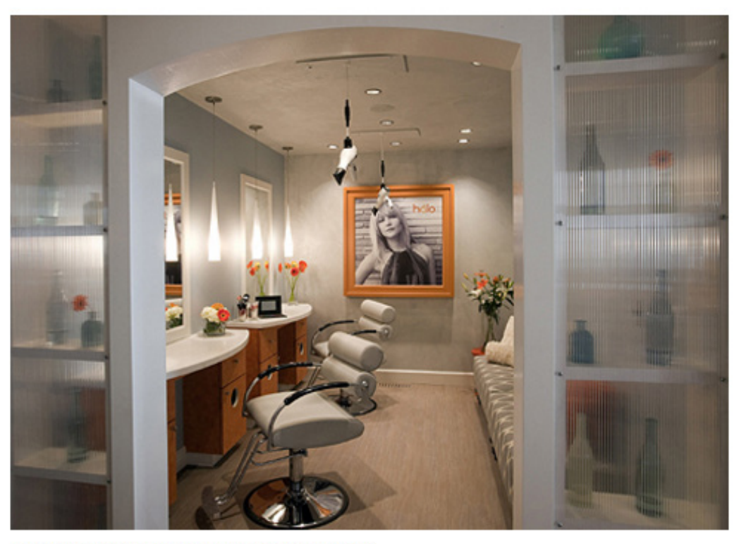
Halo Blow Dry Bar's makeup room, Burlingame