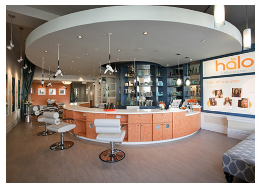
Halo Blow Dry Bar, Burlingame