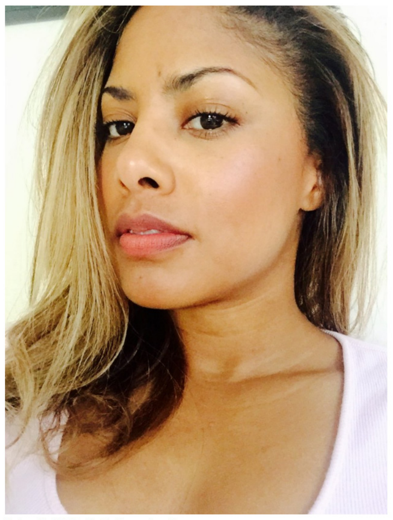
Day two of the Halo Blow Dry is holding up rather well!