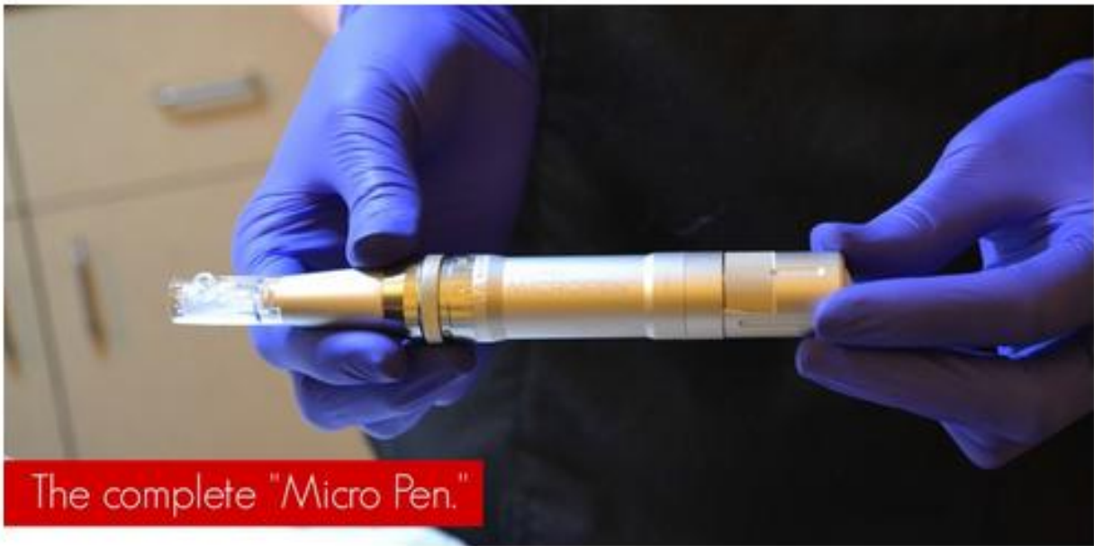
The complete "Micro Pen."