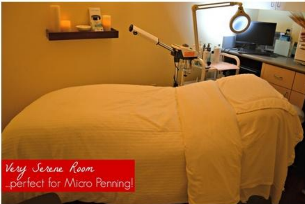
Very Serene Room ...perfect for Micro Penning!

When it was our turn we went into a nice serene room and I was able to get on a heated table . Yes girl....I was wrapped up in a warm cocoon while Hilarie prepped me for my treatment. She told me exactly what was about to happen then she numbed my face!