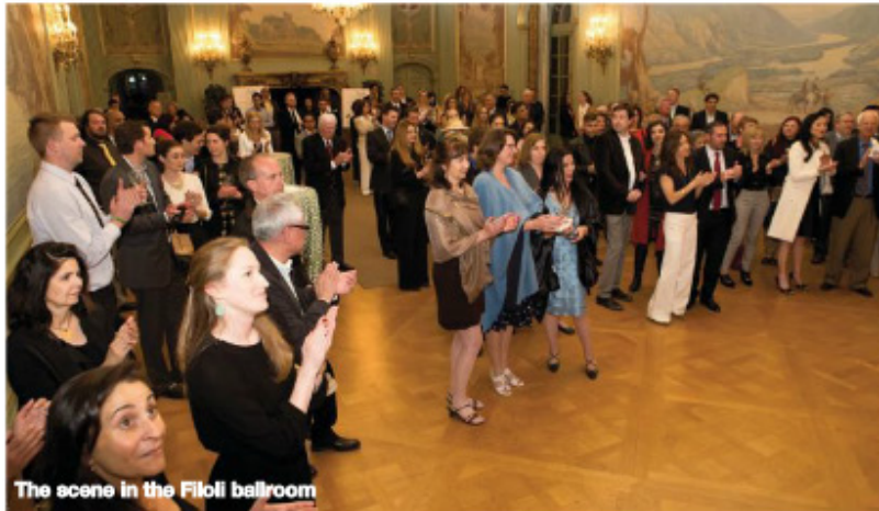
The scene in the Filoli ballroom