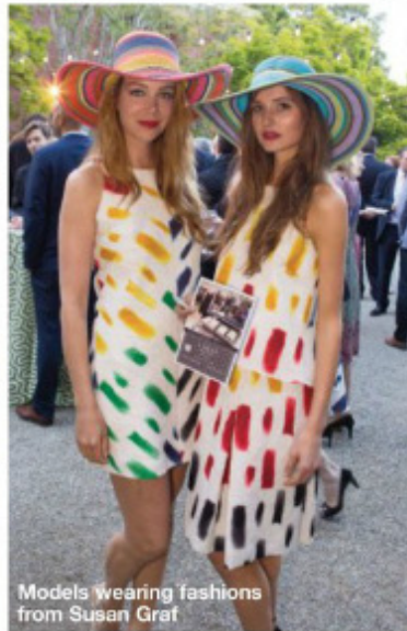
Models wearing fashions from Susan Graf