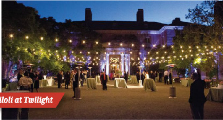
Filoli at Twilight