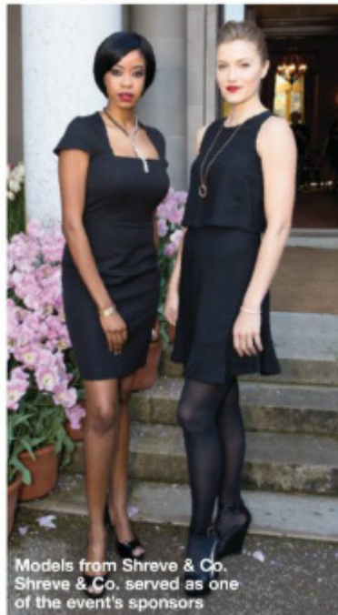
Models from Shreve & Co. Shreve & Co. served as one of the event's sponsors