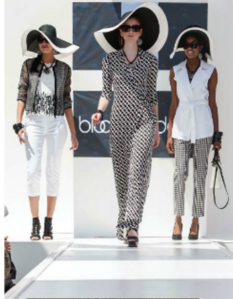
Bloomingdale's styles on the runway